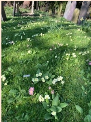
Spring in the churchyard