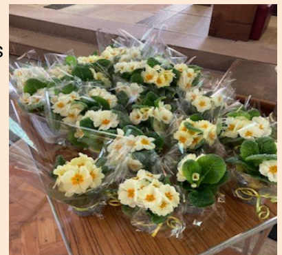
Mothering Sunday posies