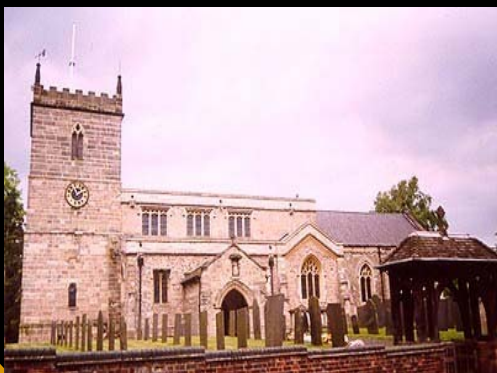
St Peter's, East Bridgford