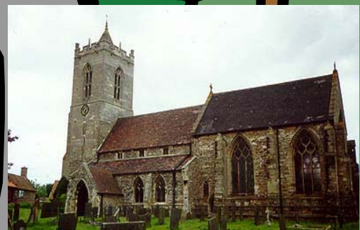
St Mary's, Car Colston