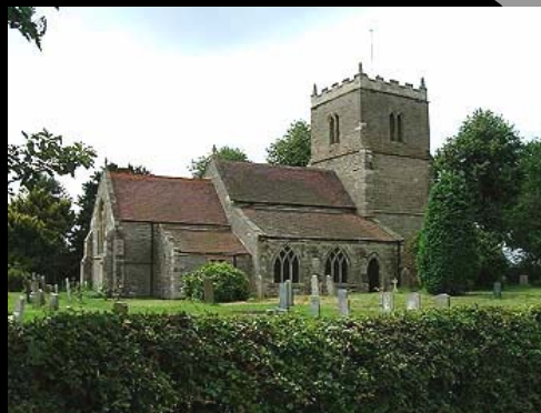
St Wilfrid's, Screveton