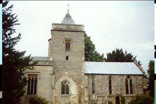
St Augustine's, Flintham